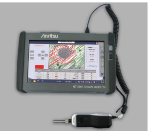
Network Master Pro MT1000A