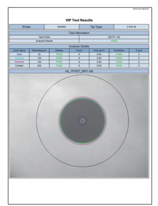
PDF Report Output